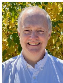
Michael Barnes Orchestra